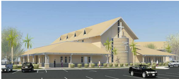
Parish Life Center- Exterior Rendering